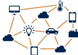
Internet of Things